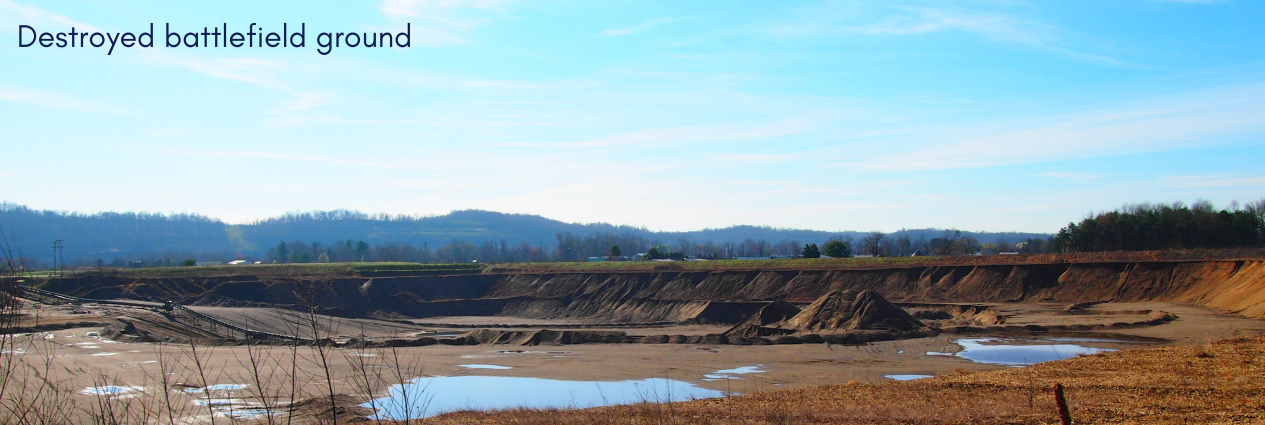
Destroyed battlefield ground

BUFFINGTON ISLAND BATTLEFIELD PRESERVATION FOUNDATION