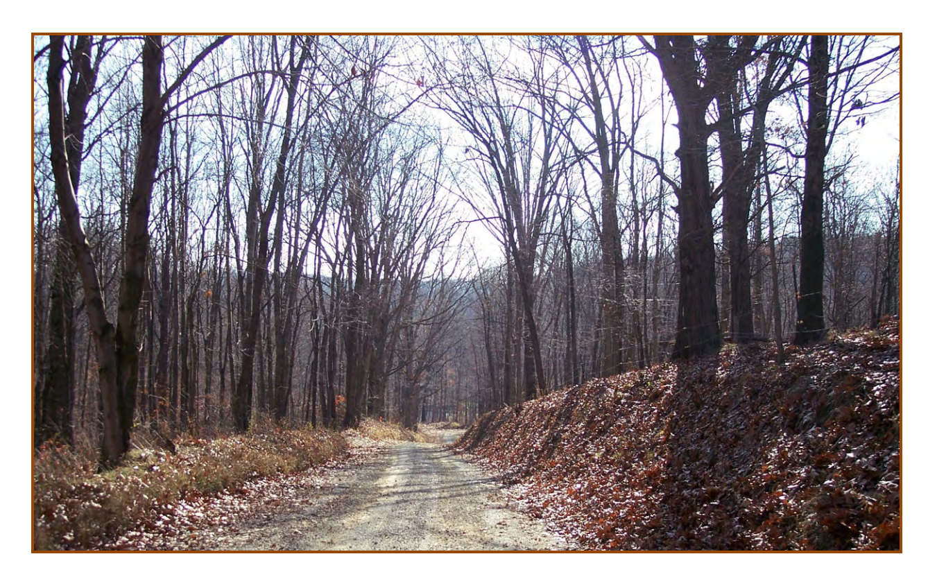
Figure 3. Ocean Road, used by retreating Confederates during the battle of Salineville , Columbiana County, Ohio. Photograph by Joseph E. Brent, 2005.

While other organizations with more general historical interests may also play important roles in battlefield preservation, the Buffington Island Battlefield Preservation Foundation is the only known local organization in Ohio dedicated solely to the goals of battlefield preservation, interpretation, and promotion.