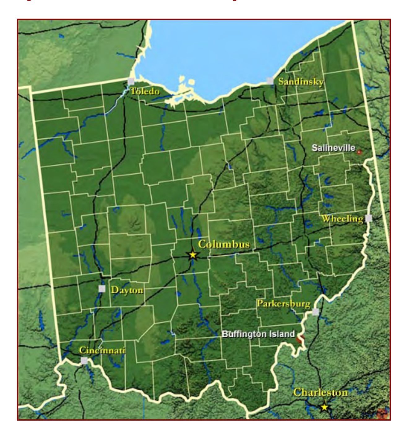
Figure 1. CWSAC Battlefields in Ohio – Buffington Island and Salineville.