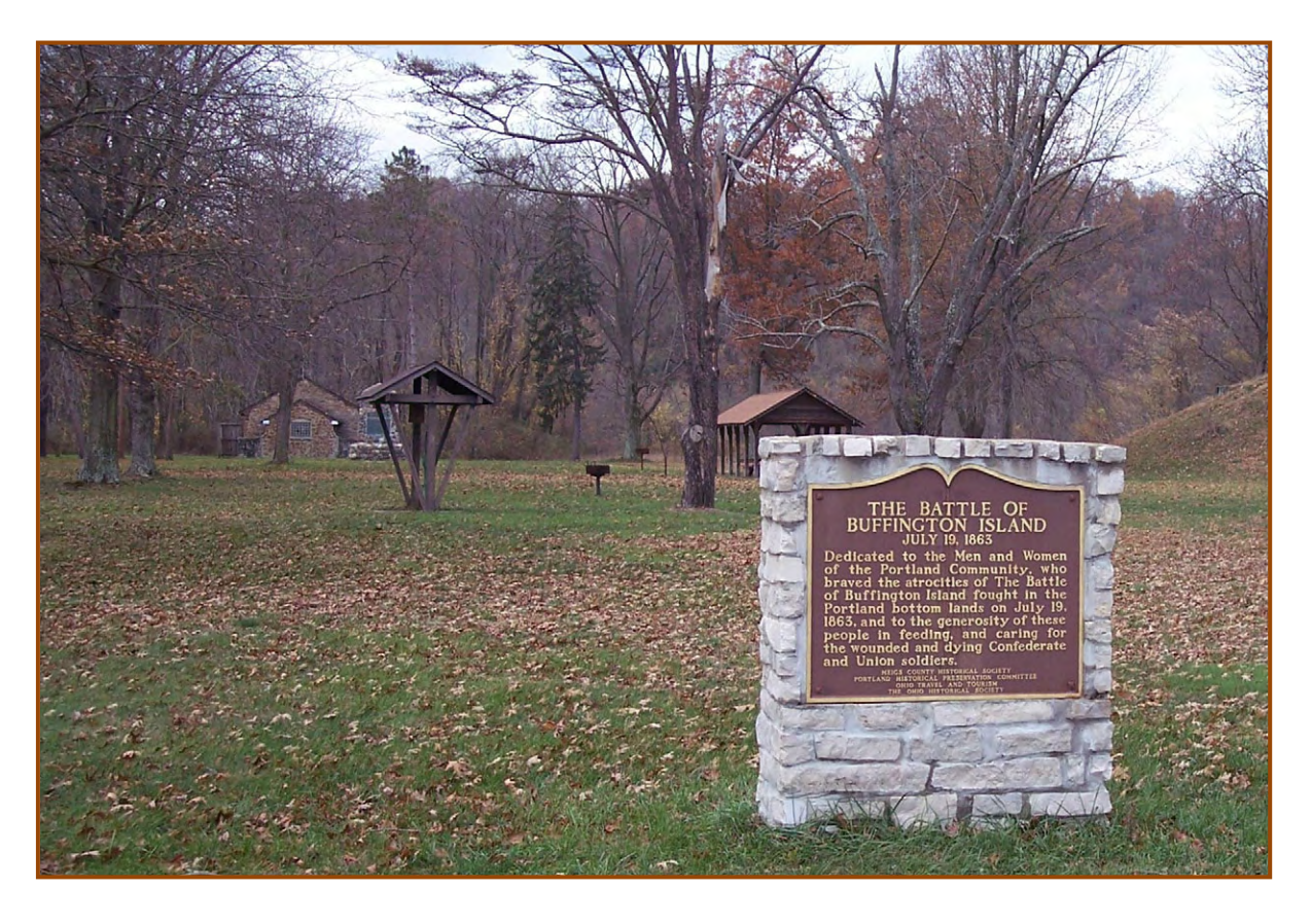
Figure 4. Monument and recreational facilities at Buffington Island State Memorial Park, Meigs County, Ohio. Photograph by Joseph E. Brent, 2005.

The ABPP asked respondents to indicate the type of interpretation available at or about the battlefield. The categories included brochures, driving tours, living history demonstrations, maintained historic features or areas, walking tours and trails, wayside exhibits, websites, and other specialized programs. The results indicate that, while there has been no effort to provide public interpretation at Salineville , the Ohio Historical Society's management efforts at Buffington Island offer public interpretation and educational opportunities with a monument and interpretive signage that describes the battlefield's history. Moreover, although there is no visitors' center at Buffington Island , there is an on-going effort to develop a museum for additional site interpretation at a near-by community center north of the state memorial park.